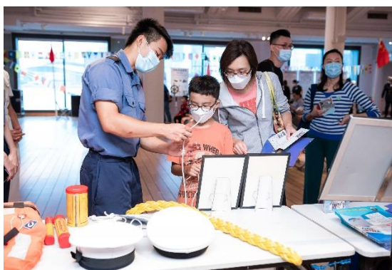
(Mooring Safety Game by Hong Kong Seamen's Union)

Funded by the Maritime and Aviation Training Fund (MATF), in collaboration with Marine Department, Hongkong Salvage & Towage Services Ltd., Hong Kong Seamen's Union, Hong Kong Sea Cadet Corps, Hong Kong Life Saving Society, The Nature Conservancy (TNC), Scout Association of Hong Kong and Vocational Training Council, HKMM opens its doors for free to the public on 25 November 2023.