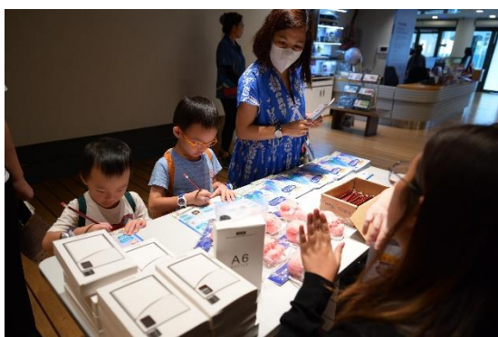
(Treasure Hunt Worksheet)