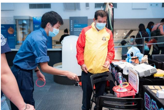
(Game Booth by Hong Kong Life Saving Society)