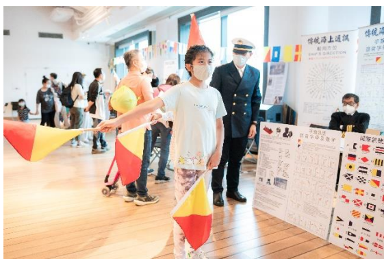
(International Signal Flag by Scout Association of Hong Kong)

services, and raise public awareness of the economic significance of the port and maritime sectors as well as the prospects of a maritime career.