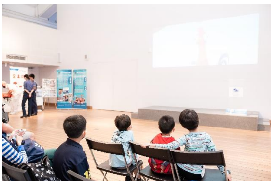
(Marine Cartoon Screening)