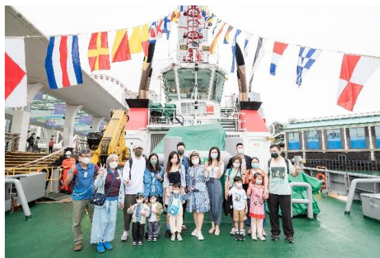
(All Aboard on the Tugboat)

Highlighted events include a refuse collection vessel demonstration, provided by the Marine Department, which will showcase the scavenging and collection of marine floating refuse and promote the importance of maintaining cleanliness at sea. Visitors can see how the vessels clean the harbour and learn about the daily operation of clean-up at sea and the latest technology applied to marine cleansing. Also, visitors can join the guided tour for visiting Hongkong Salvage & Towage Services Ltd.'s multipurpose tugboat Tai O . Get a glimpse of the deck, the engine room, crew's quarters and the galley. Registration is required for the above activities, noted in the programme details.