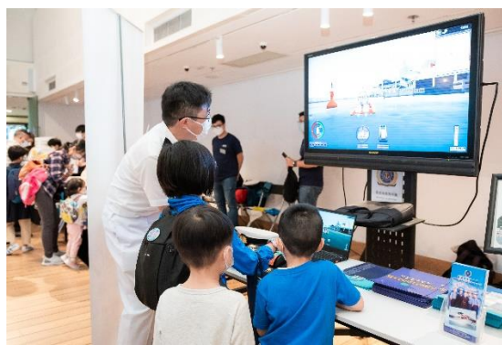
(Ship Simulator by Hong Kong Sea Cadet Corps)