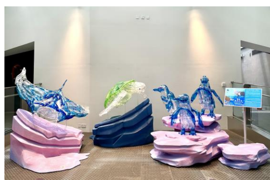
(“Plasticised Marine Life” Exhibition)