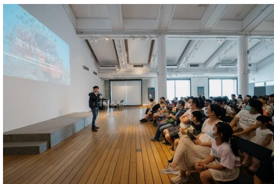
(Marine Wildlife Talks)