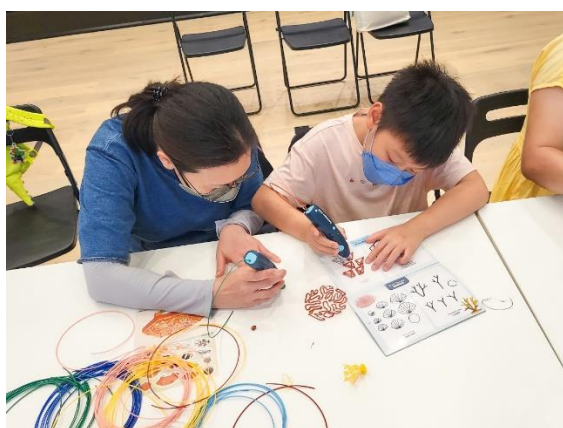
(Archireef's Coral Artwork Booth)