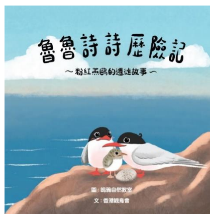
(HKBWS's Storytelling Workshop)