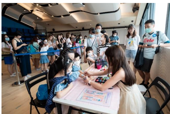
(Hand Painting Workshop)