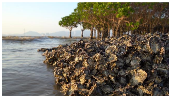
(TNC's Oyster Work Booth.)