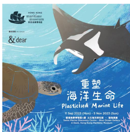
(“Plasticised Marine Life” Exhibition)