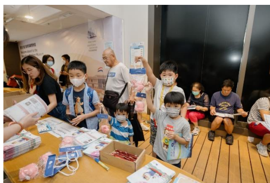
(Marine Creatures Quiz Game)