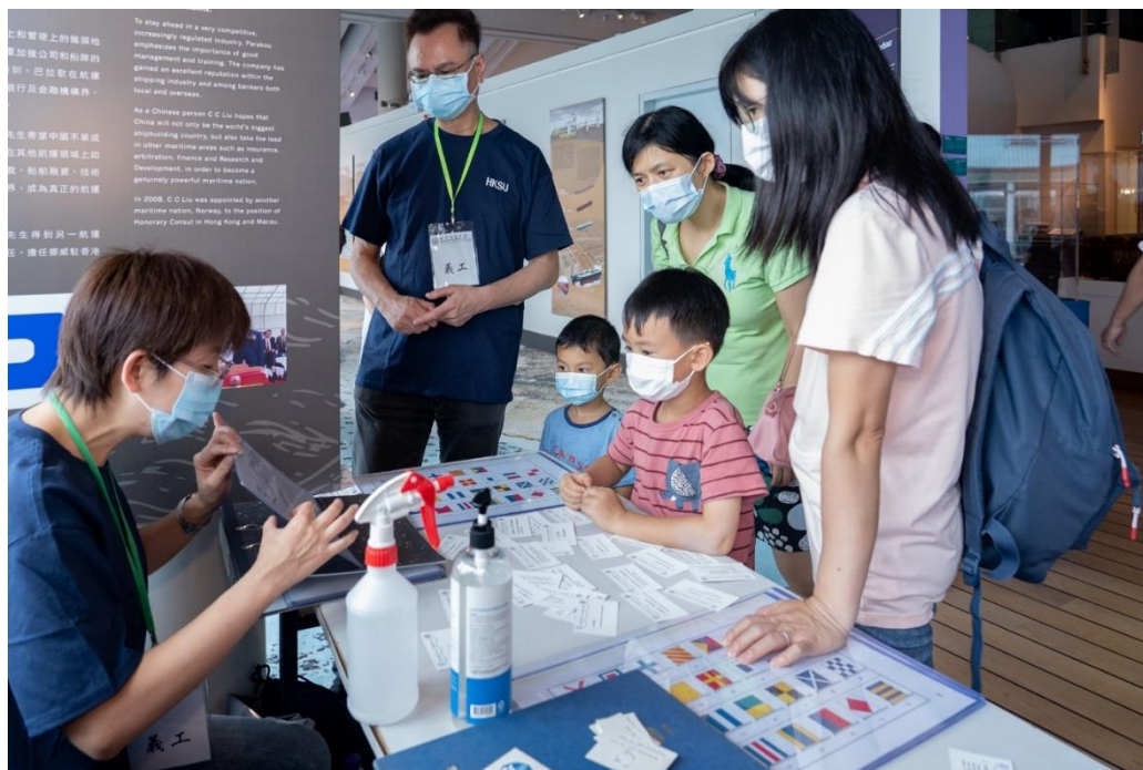
(Game Booth of Hong Kong Seamen's Union)

In addition, visitors can freely join in a myriad of family activities, including guided tours led by docents around the museum, treasure hunt, hand painting workshop etc. Moreover, marine life talks are scheduled to share knowledge with visitors about different marine ecologies and to introduce special marine animals and their habits.