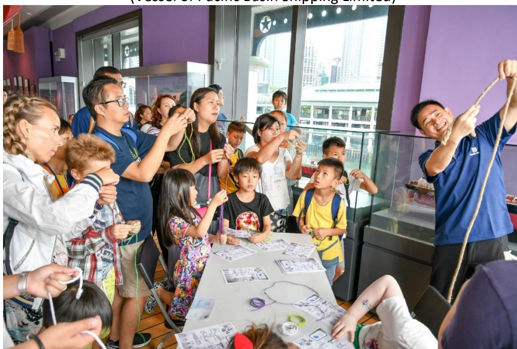
(Game Booth of Pacific Basin Shipping Limited)

Sponsored by Hong Kong-based Pacific Basin Shipping Limited, in collaboration with the Marine Department, Hong Kong Seamen's Union and LumiVoce, the Hong Kong Maritime Museum opens its door for free to the public on 25 June 2023 to celebrate this meaningful day. Pacific Basin is one of the world's leading owners and operators of modern Handysize