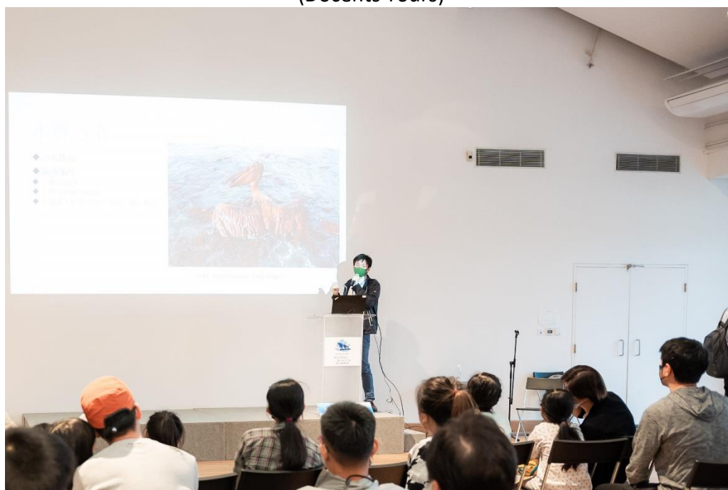
(Marine Wildlife Talks)