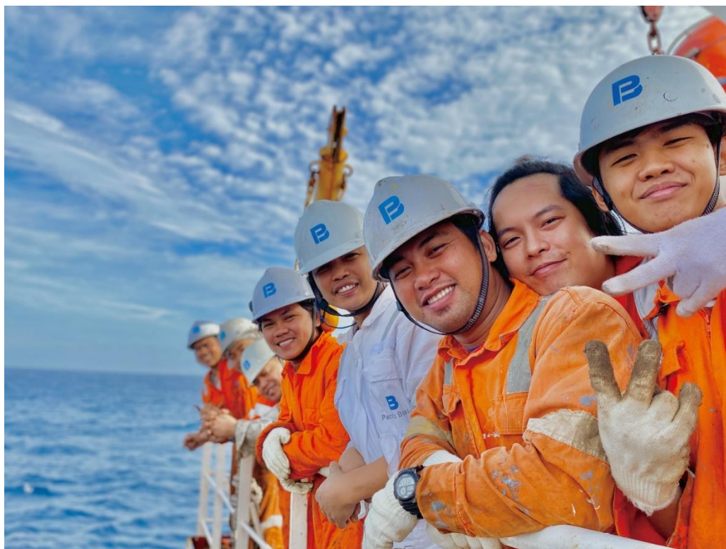
(Seafarers of Pacific Basin Shipping Limited)

The annual International Day of the Seafarer was established by the International Maritime Organization in 2010 as a tribute to the 1.6 million seafarers around the world for their essential contribution to world trade and the global economy. Around 90% of everything we eat, use and consume is brought to us by sea – even during COVID-19 when measures to contain the pandemic around the world posed extra hardships on ships' crews, including making it very difficult for ship owners to change crews and get their seafarers home.