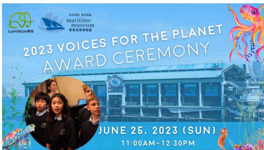
(2023 Voices for the Planet Award Ceremony)

One special event will also take place at the museum. LumiVoce will have its first in-person award ceremony - 2023 Voices for the Planet Award Ceremony - in the Hong Kong Maritime Museum. The Voices for the Planet education programme inspires young people to love and protect wildlife and biodiversity by creating their own wildlife artworks in five different art forms including drawing, writing, photography, videography and singing.