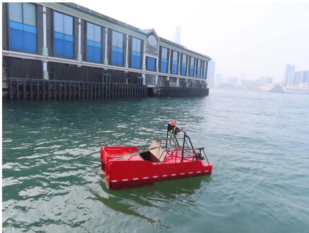
(Refuse Collection Vessels Demonstration by Marine Department)

Furthermore, game booths presented by the Hong Kong Seamen's Union will be set up for children and their families to interact with the Union's youth volunteers and learn about the life of a seafarer. A refuse collection vessel demonstration provided by the Marine Department will showcase the scavenging and collection of marine floating refuse and promote the importance of maintaining cleanliness at sea. Visitors can see how the vessels clean the harbour and learn about the daily operation of clean-up at sea and the latest technology applied to marine cleansing.