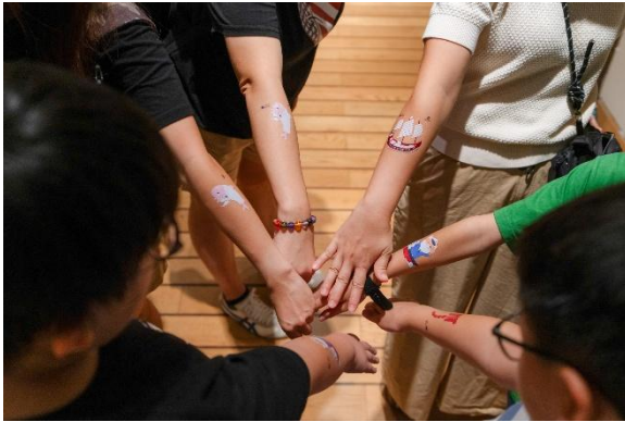
(Tattoo Sticker Experience)