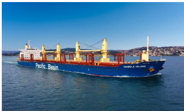
(Vessel of Pacific Basin Shipping)

A series of engaging activities and souvenirs will be available for children and families, providing a unique opportunity to learn more about the maritime industry and the rich maritime history of Hong Kong. Highlights include game booths, photo booth, tattoo sticker experience, curator-guided tours, video screening and a simulator experience designed specifically for children. This year, we have specially prepared activities to enhance the visitor experience, such as the “Seafarer's Human Library: The Pulse of Young Seafarers” and “Hong Kong Sailing to the World: Maritime x Art Dialogues”.