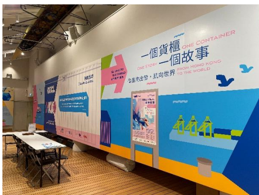
(Art Container Project - Long Gallery)