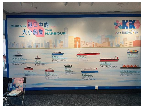
(Art Container Project - B5 Gallery)

香港海事博物館有限公司 HONG KONG MARITIME MUSEUM LIMITED