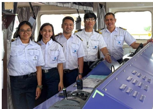
(Seafarers of Pacific Basin Shipping)

Kong community to enjoy a range of engaging activities while discovering how seafarers connect the world through safe and reliable journeys.