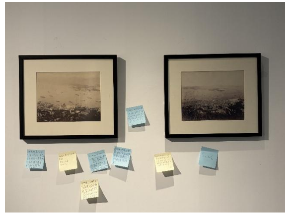
(“Victoria Harbour and YOU” Exhibition – B6 Gallery)

In addition to these fun activities, visitors can take the opportunity to explore the newly unveiled “Project Art Container” at Long Gallery and B5 Gallery. The experience continues with the new exhibition “Victoria Harbour and YOU” at the B6 Gallery. 18 historical photographs spanning the 1860s to the 1970s act as a time machine, tracing the harbour’s evolution. Come share your story at the museum and leave your note under the photos. Your words will become the most heartfelt footnote to this history.