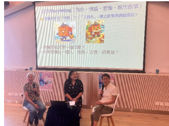
(Hong Kong Sailing to the World: Maritime x Art Dialogues)