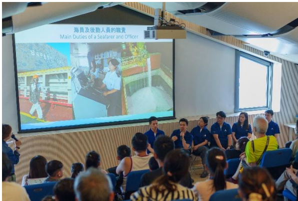
(Seafarer's Human Library: The Pulse of Young Seafarers)