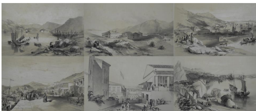
Lithographs Murdoch Bruce

The exhibition follows the development of Hong Kong from 1842 to the present day, examining how various vessels change alongside Hong Kong society. The increase in commercial activity and population saw the rise of cross-harbour transportation vessels such as ferries and motorboats, catering to the demand for crossing the Victoria Harbour from the late 19th century. Meanwhile, vessels ferrying cargo since before the opening of the port also experienced changes in size, build and function, adapting to the ever-changing needs of Hong Kong's freight industry.