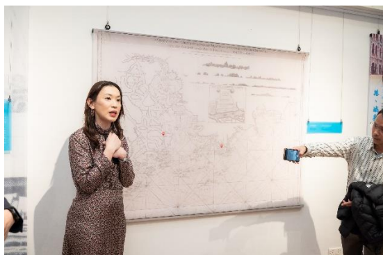
(Twenty Questions about "Across Victoria Harbour" Talk)