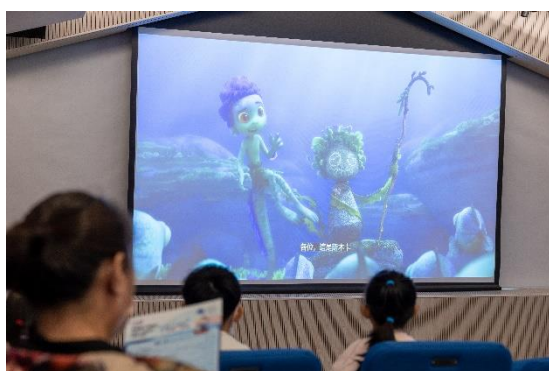
(Marine Cartoon Screening)

Through the Twenty Questions about the 'Across Victoria Harbour' Talk and guided tours on the free admission day, visitors can delve deeper into the exhibition content, curatorial concept, and uncover the hidden stories behind the exhibits of the special exhibition.