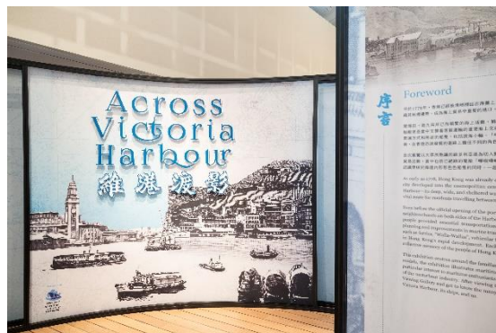
('Across Victoria Harbour' Special Exhibition)