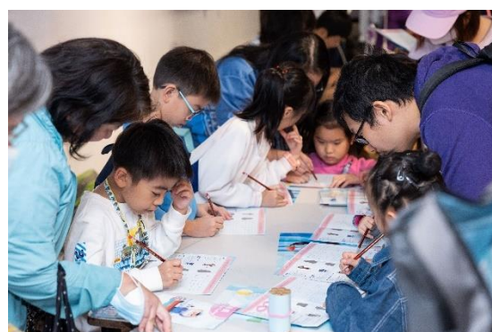
(Distribution of Activity Worksheets and Storybooks for Children)