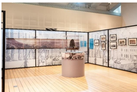
(Section 1: The Harbour, the City, and the People)