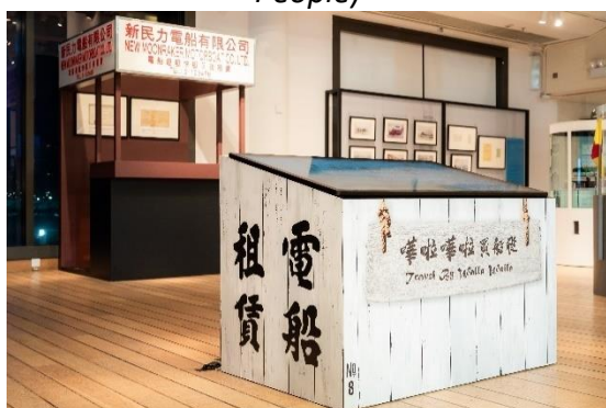
('Travel by Walla-Walla' Multimedia Game and Old Motorboat Ticket Booth)