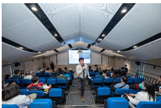
(Marine Wildlife Talk)