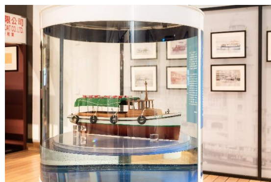
(Model of 'Walla-Walla')