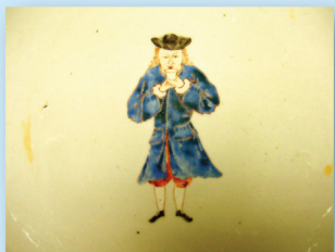
粉彩內繪 持杯外繪描金字母 團紋大瓷碗

你是十九世紀的海洋探險家，請找出下列展品： You are an ocean explorer of the 19 th century, please spot out the following exhibits: