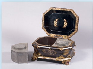
雙格 _____ 盒