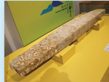
古物古蹟辦事處借展 On loan from the Antiquities and Monuments Office

請回答以下問題。 Please answer the following questions.