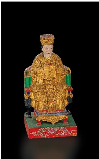
Tin Hau statue, late 19th century, HKMM Collection