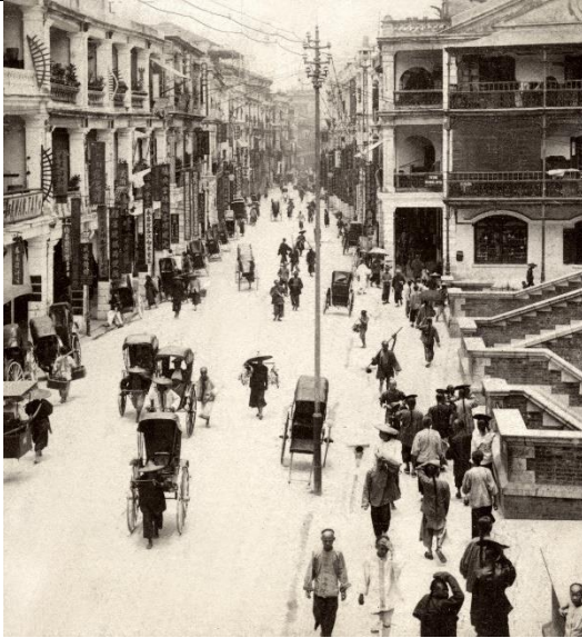
Queen's Road Central 1984