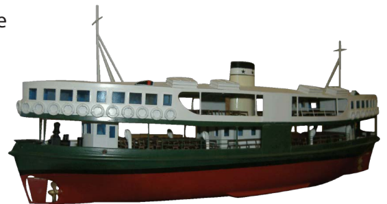
Star Ferry Model

The panel titled “Vital Transport” can help you.